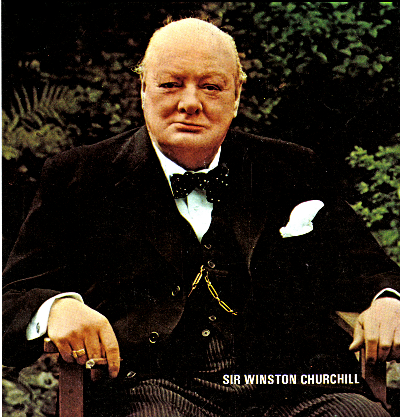
SIR WINSTON CHURCHILL